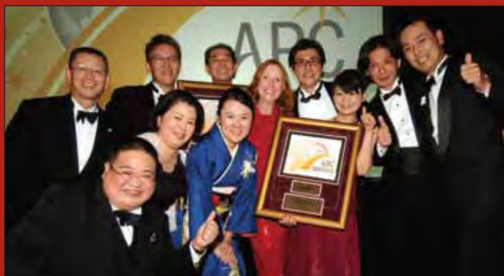
Thumbs up to all the fabulous winners! Party on!