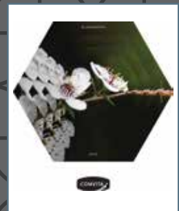
BEST OF INTERNATIONAL INSIGHT CREATIVE LIMITED for CONVITA NZ LTD. (New Zealand)