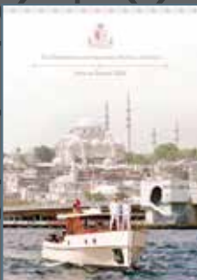
BEST OF HONG KONG SAR IONE FINANCIAL PRESS LIMITED for THE HONGKONG AND SHANGHAI HOTELS, LIMITED