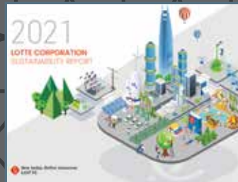
BEST OF KOREA TALANTONE CREATIVE GROUP for LOTTE CORPORATION