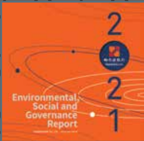
BEST OF CHINA TOPPAN MERRILL LIMITED for HARBIN BANK CO., LTD.