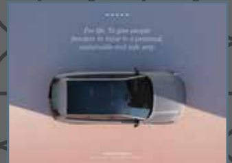
BEST OF EUROPE SOLBERG / VOLVO CARS for VOLVO CARS (Sweden)