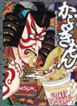
BEST OF JAPAN SHIAN INC. for NISSIN FOODS HOLDINGS CO., LTD.