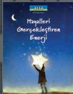
BEST OF TÜRKİYE FINAR KURUMSAL İLETİŞİM ÇÖZÜMLERİ LTD. STI. for AKSA POWER GENERATION