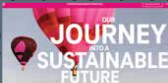
BEST OF GERMANY STAKEHOLDER REPORTING GmbH & CO. KG for DEUTSCHE TELEKOM AG