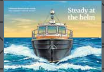
BEST OF USA CALIFORNIA WATER SERVICE GROUP