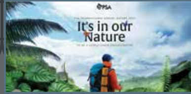
BEST OF SINGAPORE META FUSION PTE LTD for PSA INTERNATIONAL PTE LTD