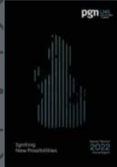
BEST OF INDONESIA DNA KOMUNIKA for PT PGN LNG INDONESIA