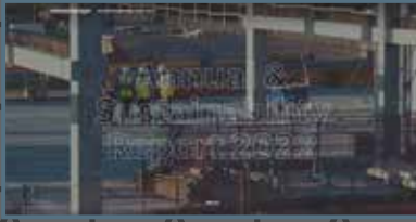
BEST OF AUSTRIA NEXXAR GmbH for WIENERBERGER AG