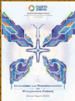
BEST OF PEOPLE'S REPUBLIC OF CHINA CRE8 (GREATER CHINA) LTD. for ASIAINFO TECHNOLOGIES LIMITED