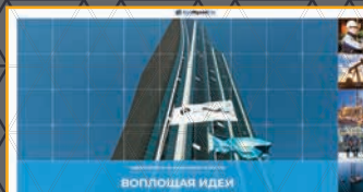
BEST OF ASIA FANDA CORPORATE COMMUNICATIONS LTD. for JSC NC KAZMUNAYGAS (Republic of Kazakhstan)