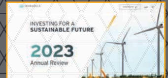
BEST OF MIDDLE EAST PUBLICIS SAPIENT for MUBADALA INVESTMENT COMPANY (United Arab Emirates)