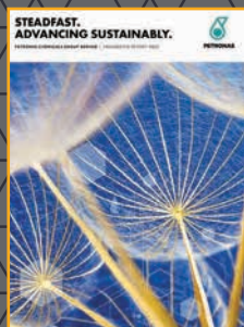
BEST OF MALAYSIA NOVA FUSION SDN BHD for PETRONAS CHEMICALS GROUP BERHAD