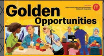
BEST OF USA AVILA CREATIVE for McDONALD'S CORPORATION