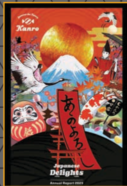
BEST OF JAPAN KANRO INC.