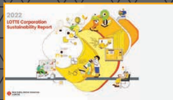
BEST OF SOUTH KOREA TALANTONE CREATIVE GROUP for LOTTE CORPORATION