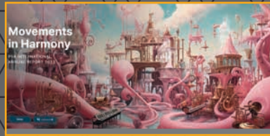
BEST OF SINGAPORE SILICONPLUS COMMUNICATIONS PTE LTD for PSA INTERNATIONAL PTE LTD