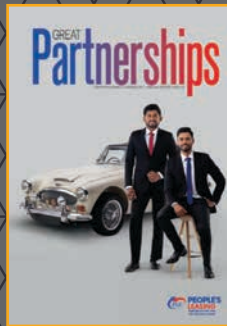
BEST OF SRI LANKA EMAGEWISE (PVT) LIMITED for PEOPLE'S LEASING & FINANCE PLC