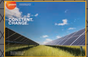
BEST OF INTERNATIONAL INSIGHT CREATIVE LTD. for GENESIS ENERGY (New Zealand)