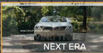
BEST OF GERMANY 3ST KOMMUNIKATION GMBH for BMW AG