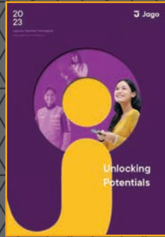
BEST OF INDONESIA MITRAGRAFIA (PT MITRA GAGASEMHA KREASI) for PT BANK JAGO TBK