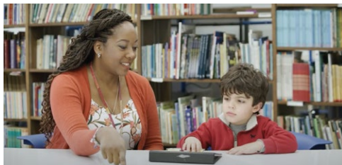
BEST OF ADVERTISING - Video Campaign M:7 Agency Allegheny Intermediate Unit (USA)