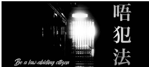
BEST OF GOVERNMENT Hong Kong Correctional Services "Be a law-abiding citizen, and you'll have more choices in life." (HONG KONG SAR PRC)