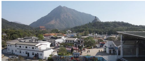
BEST OF SPECIAL PROJECTS Ngong Ping 360 Limited LEAD ON ASIA LIMITED Ngong Ping Outdoor ARTcation (HONG KONG SAR PRC)