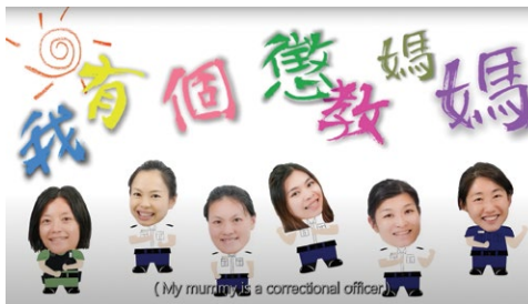
BEST OF IN-HOUSE PRODUCTIONS Hong Kong Correctional Services My Mummy is a Correctional Officer (HONG KONG SAR PRC)