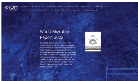
ONLINE ANNUAL REPORTS - Non-Profit Organization International Organization for Migration (IOM) World Migration Report Interactive (SWITZERLAND)