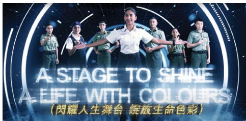
BEST OF MOBILE MEDIA Hong Kong Correctional Services Recruitment Campaign – Encourage Ethnic Minority to Join CSD (HONG KONG SAR PRC)