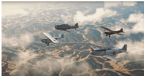
BEST OF EVENT PROMOTION Fourthirds Image Works KAI (KOREA AEROSPACE INDUSTRIES, LTD.) KF-21: Korea's first home-grown fighter jet (SOUTH KOREA)