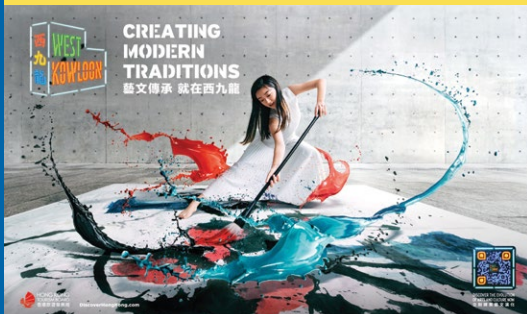
BEST OF ADVERTISING - Multi-Platform Campaign, BEST OF ARTS & CULTURE, & BEST OF TOURISM/TRAVEL Hong Kong Tourism Board Hong Kong Neighbourhoods: West Kowloon (HONG KONG SAR PRC)